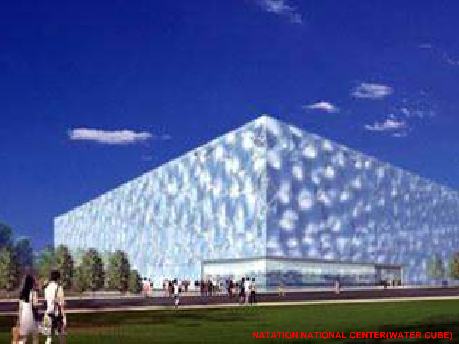
NATATION NATIONAL CENTER(WATER CUBE)