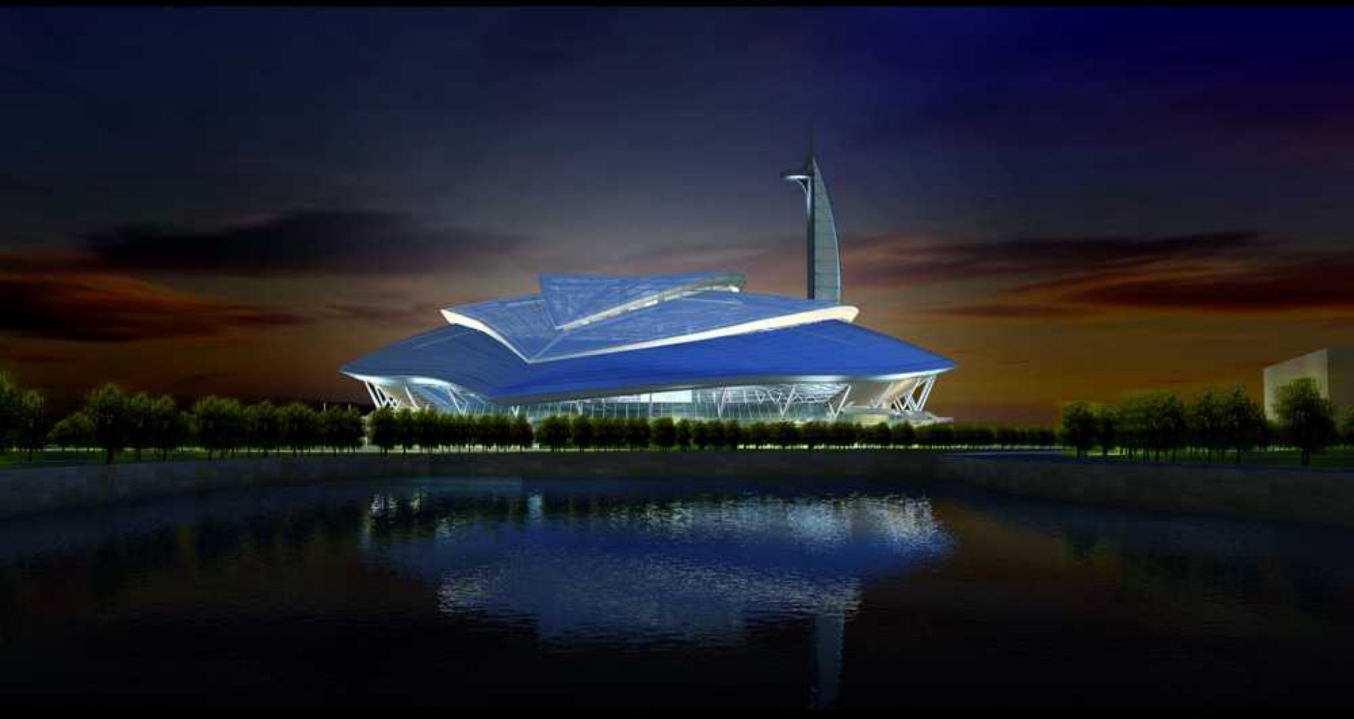
● 赛后夜景 Night View (After the event)