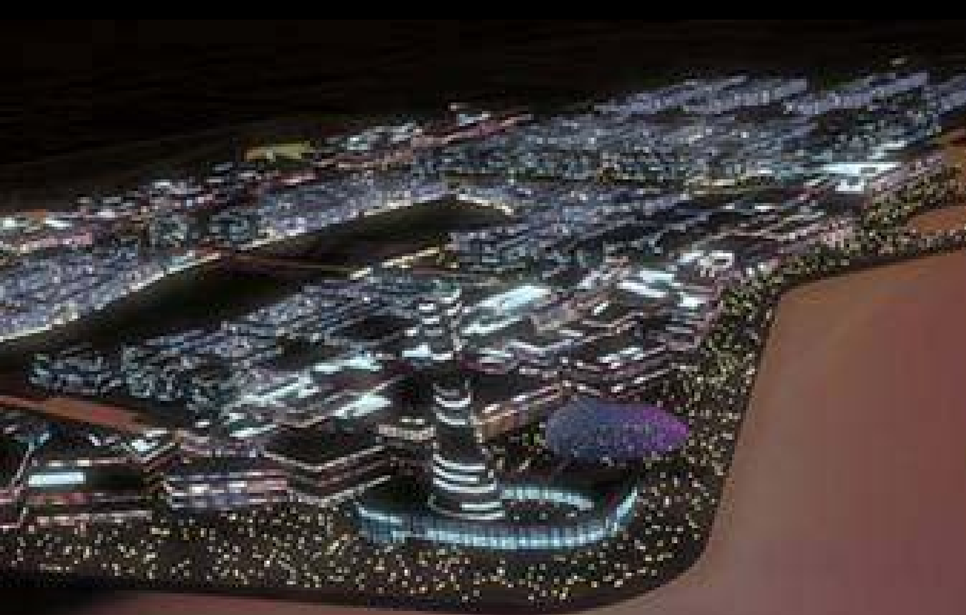
ECO DONGTAN CITY