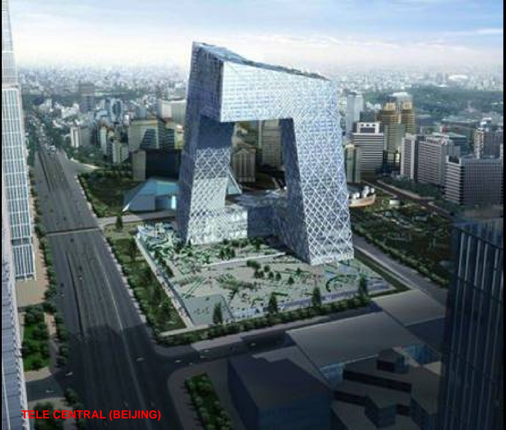
TELE CENTRAL (BEIJING)