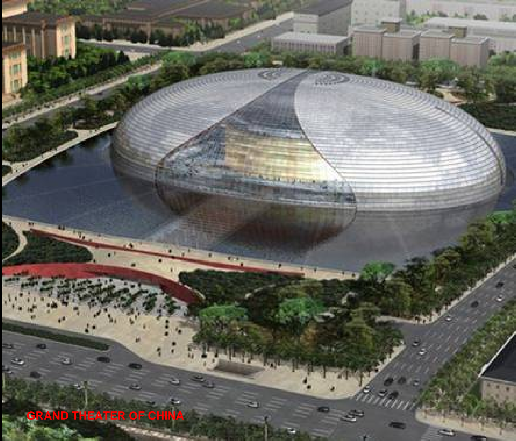
GRAND THEATER OF CHINA