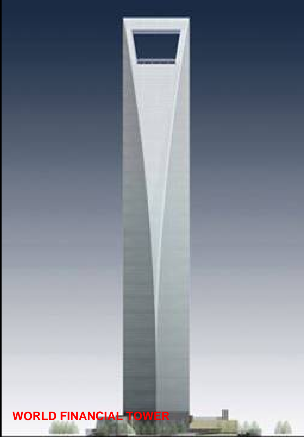
WORLD FINANCIAL TOWER