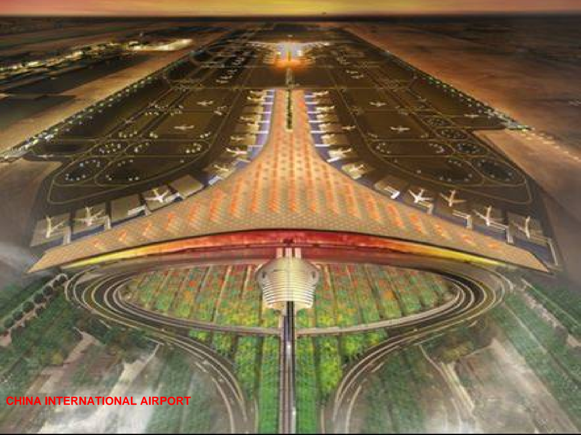
CHINA INTERNATIONAL AIRPORT